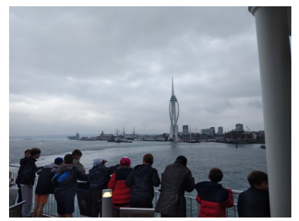
Isle of Wight Photos