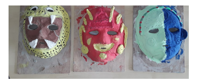
Willow Class Mask Making