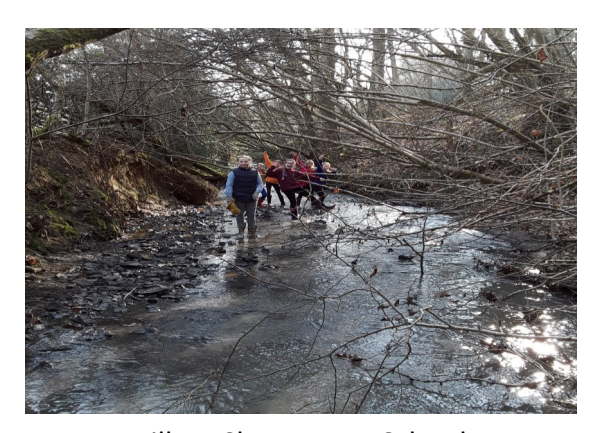
Willow Class Forest School