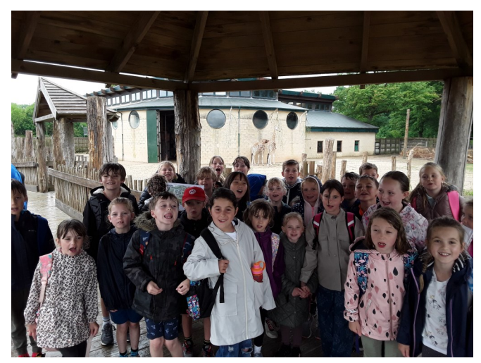
Oak Class Amazing Art Week Work